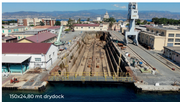
150x24,80 mt drydock